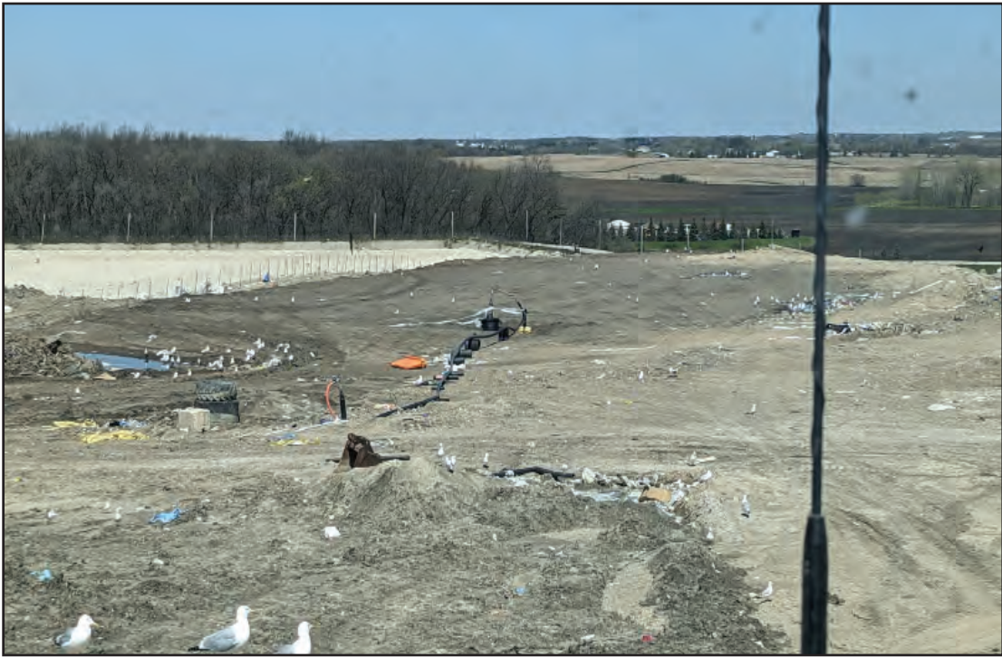
Covered area of Phase 4