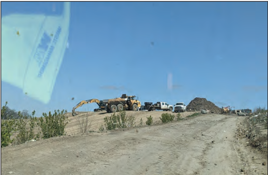
Overlay between Phases 3 & 4, access road placement as well