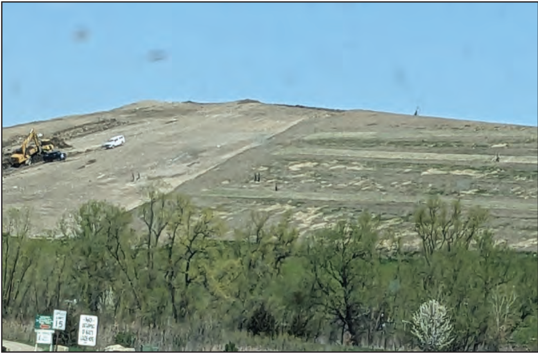
Previous cap project, west slope, vegetation starting to grow