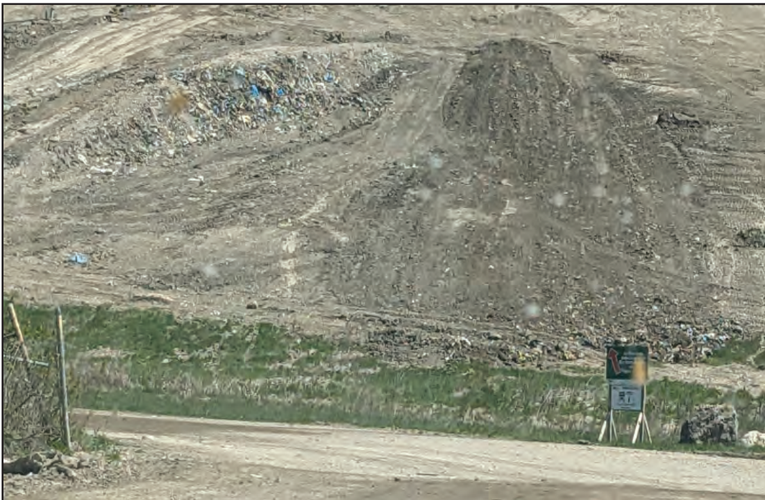
Removal of overburden and shaping West slopes of Cap project