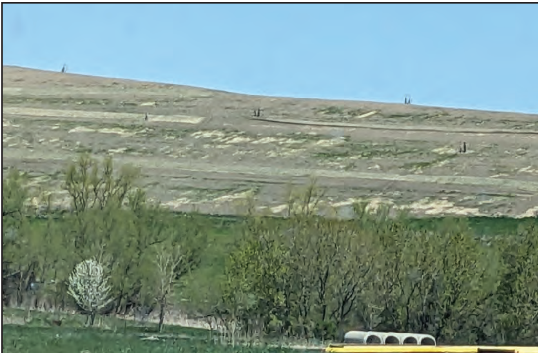
Previous cap project, west slope, vegetation starting to grow