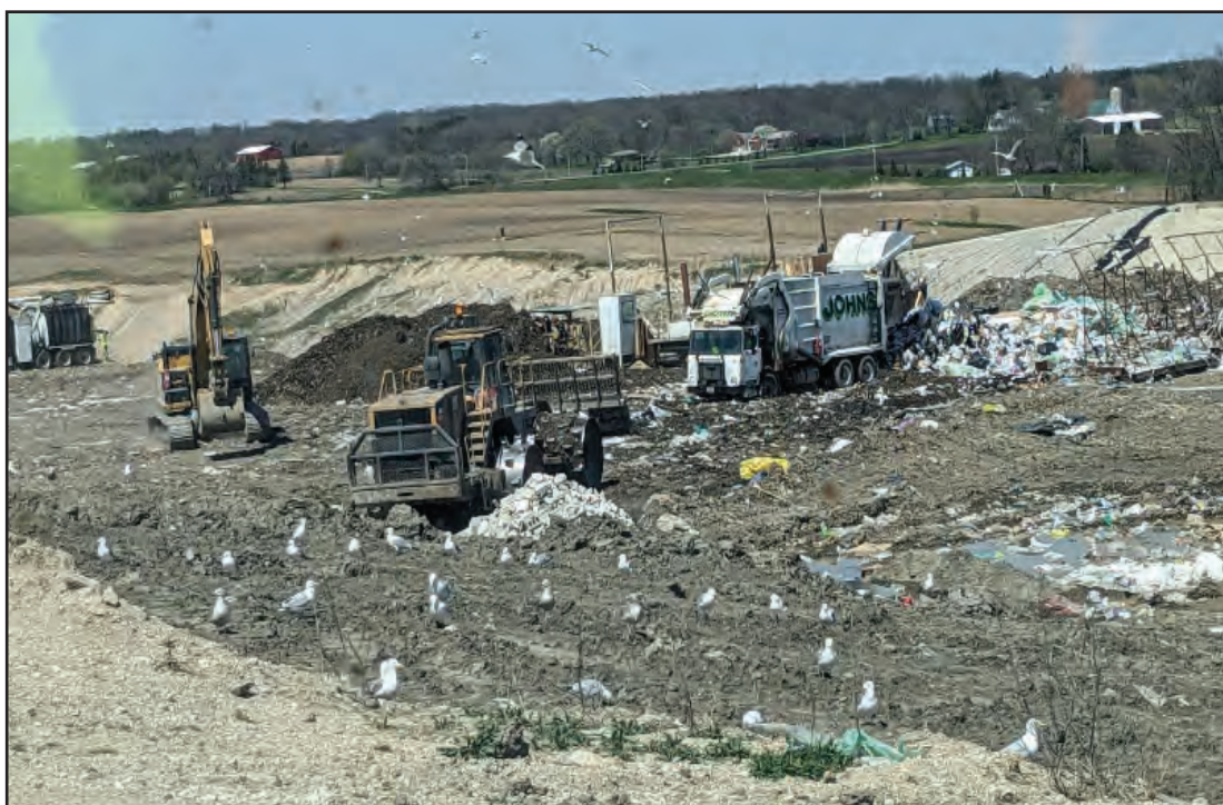
Filling of West slope at Edge of Phase 4