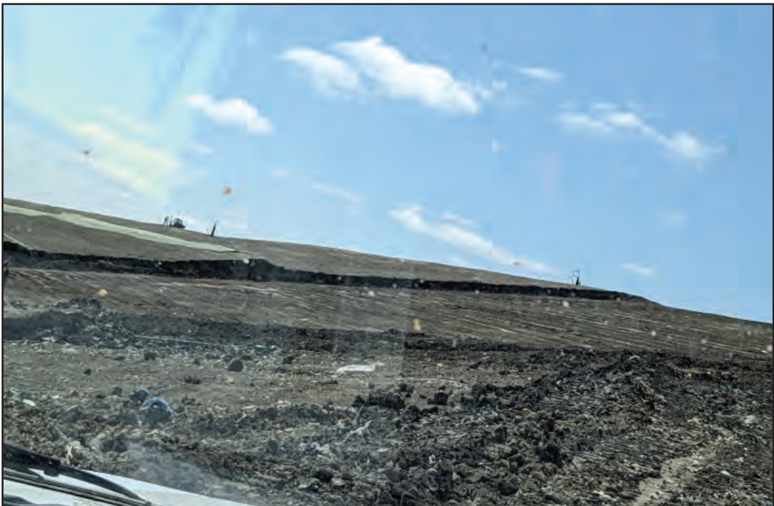
West slope of new cap project