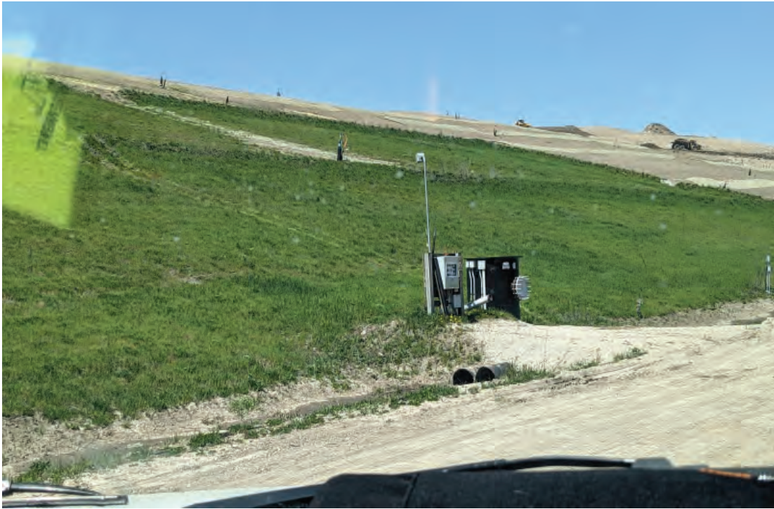
East slope previous cap project, well vegetated