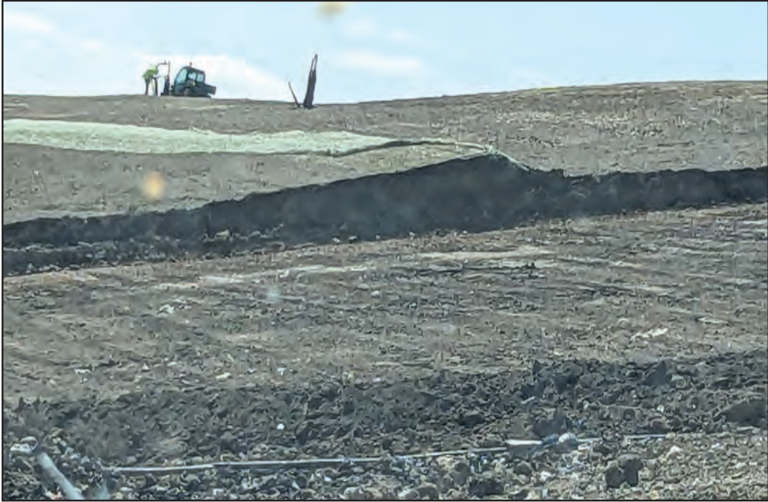
Slope restoration for Cap project