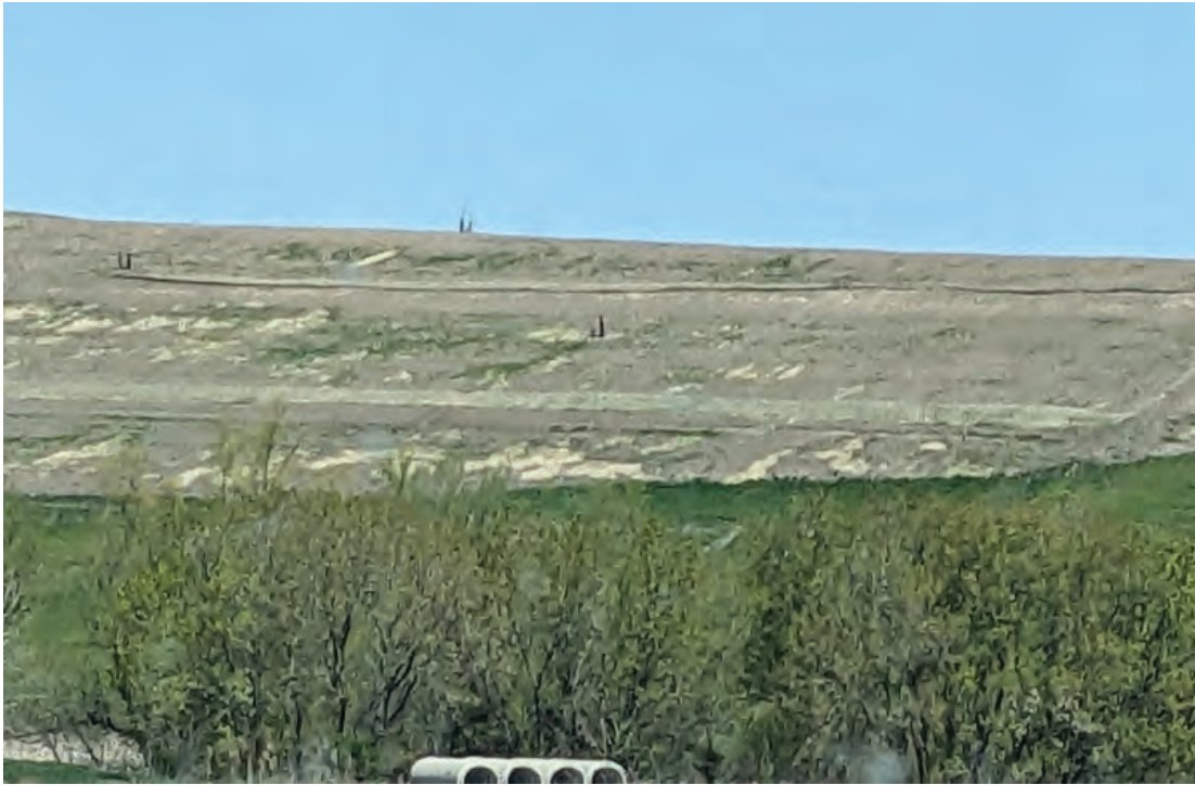
Previous cap project, west slope, vegetation starting to grow