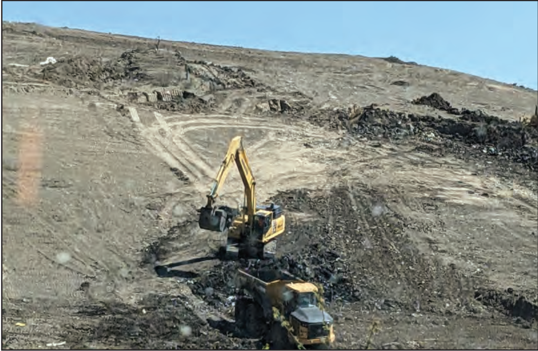
Removal of overburden and shaping West slopes of Cap project