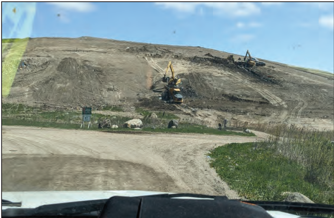
Removal of overburden and shaping West slopes of Cap project