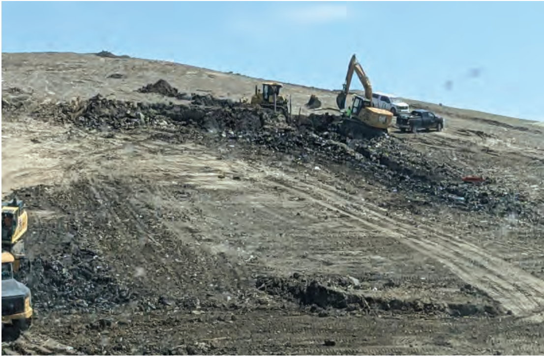
Removal of overburden and shaping West slopes of Cap project