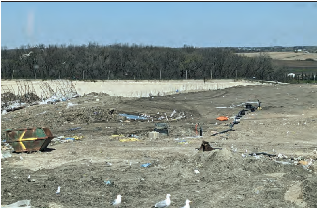
Phase 4 well covered and leading to working face on West edge