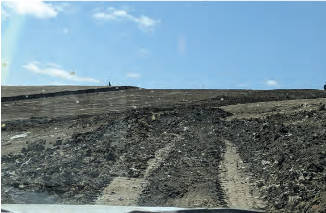
West slope of new cap project