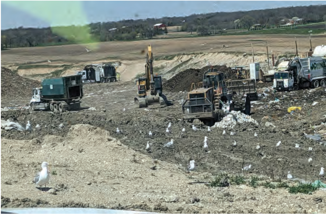
Phase 4; current lift below site grades