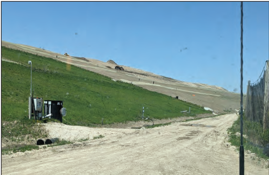
East slope of landfill footprint