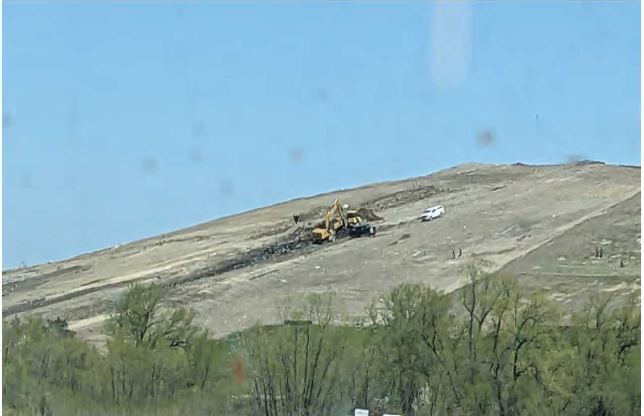
Removal of overburden and shaping West slopes of Cap project