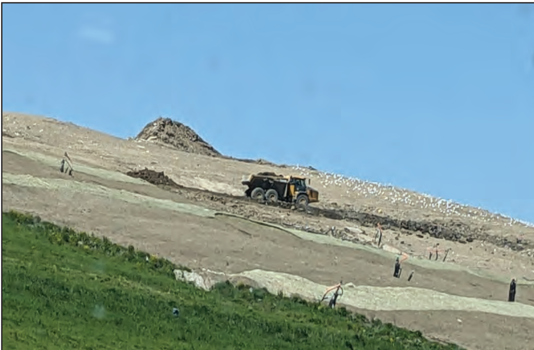
East slope, new cap project, truck hauling overburden to working face